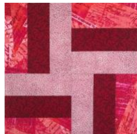
PUDDING & PIE