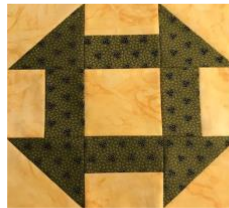
HOLE IN THE BARN DOOR or CHURN DASH