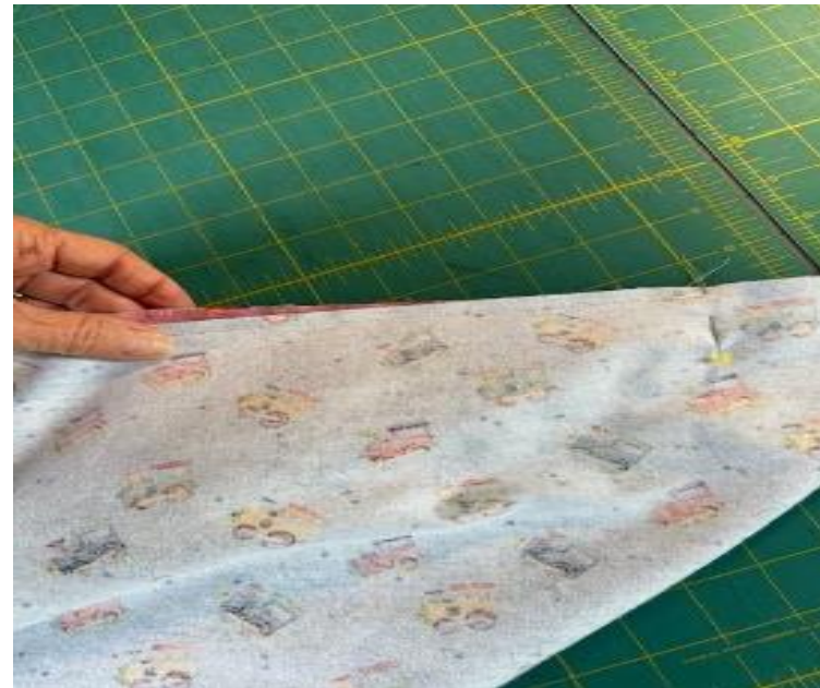
Grab the two adjacent sewn sides, matching them together