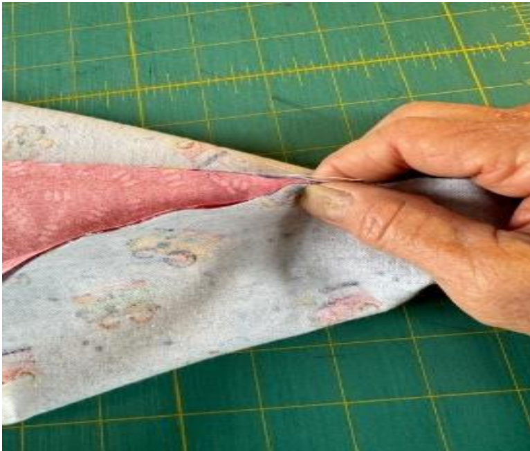
Grab/pinch the sewn tip of one corner