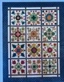
2024 Opportunity Quilt $1 each or 6 tickets for $5