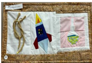
It's Not Rocket Science CAROL SHERVEM