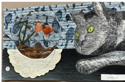
See Eye To Eye JOANIE MARTIN