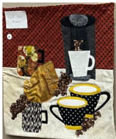
Spilled the Beans CAROL SUMMERS