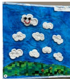
On Cloud Nine ELENA WALTHOUR