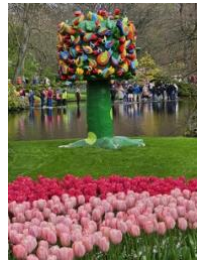
Tulip River w/sculptures