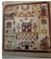
STRAWBERRY HILL QUILT

We have 5 sets of different Blocks of the Month to raffle so this will continue every other month.