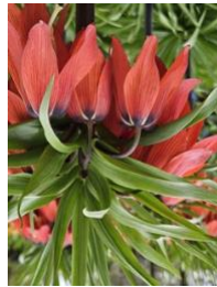
Emperors Crown tulips