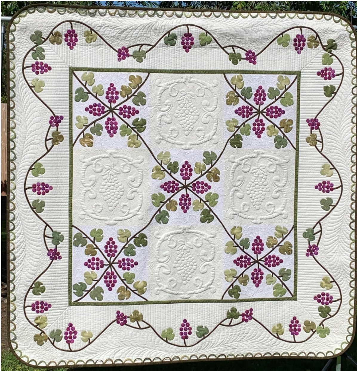
Applique by Pat Rosander , Pieced and quilted by Sandy Clark .

This beautiful quilt has a white and cream background with an appliqued grape motif of purple with green vines and leaves. The quilting is exquisite with intricate designs enhancing the grape motif with trapunto. Rouleau loops adorn the border along with feathers. Sandy reports that she enjoyed completing the custom trapunto sections, using two layers of wool to create the lovely relief. Champagne colored thread was used to enhance the shadowing of the trapunto. The quilt measures 70" x 71" and was displayed to the public for the first time on September 20 at the Central CA Women's Conference .