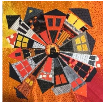
DRESDEN NEIGHBORHOODS Halloween