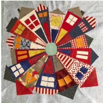
Memorial Day/4 th of July