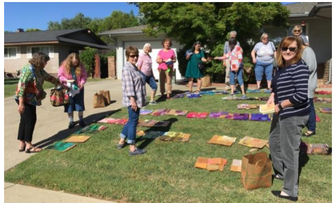
STASH GIVE AWAY 'SHOPPERS'

ANY UNCLAIMED FABRIC WILL BE AVAILABLE AT THE JUNE IN-PERSON MEETING