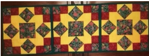
Table runner by Shannon Mueller

A few of last month's 'Quilt As You Go' results are shown here. Individual blocks were machine quilted and then joined together with one of the methods we learned.