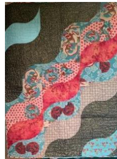
Two quilts finished for the Asian Challenge

Our guild stash was given with some beautiful Asian-themed fabrics. Enough of them that we want to share! The caveat is that you need to make a quilt out of it (size does not matter) and save it until November