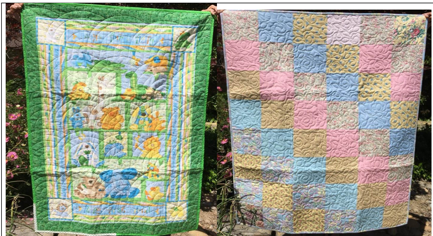
MORE COMFORT QUILTS