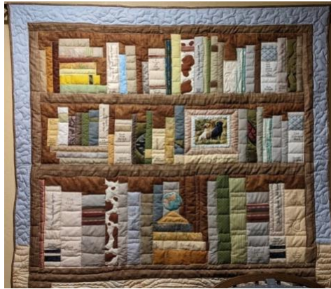
SHELTERING AMIDST THE STORM

My husband and I are spending Christmas Eve at home. We have celebrated with a turkey dinner and will celebrate Christmas Eve with a service via Zoom this evening. In between these two events we listened to the news about COVID 19 and how the numbers of people infected and dying are increasing exponentially in our county. Our two sons are not traveling to Fresno from out of state to celebrate with our family in Fresno. With our blessing they too are sheltering at home.