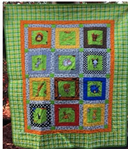
LOOKS LIKE BRIGHT, BOLD, BEAUTIFUL QUILTS