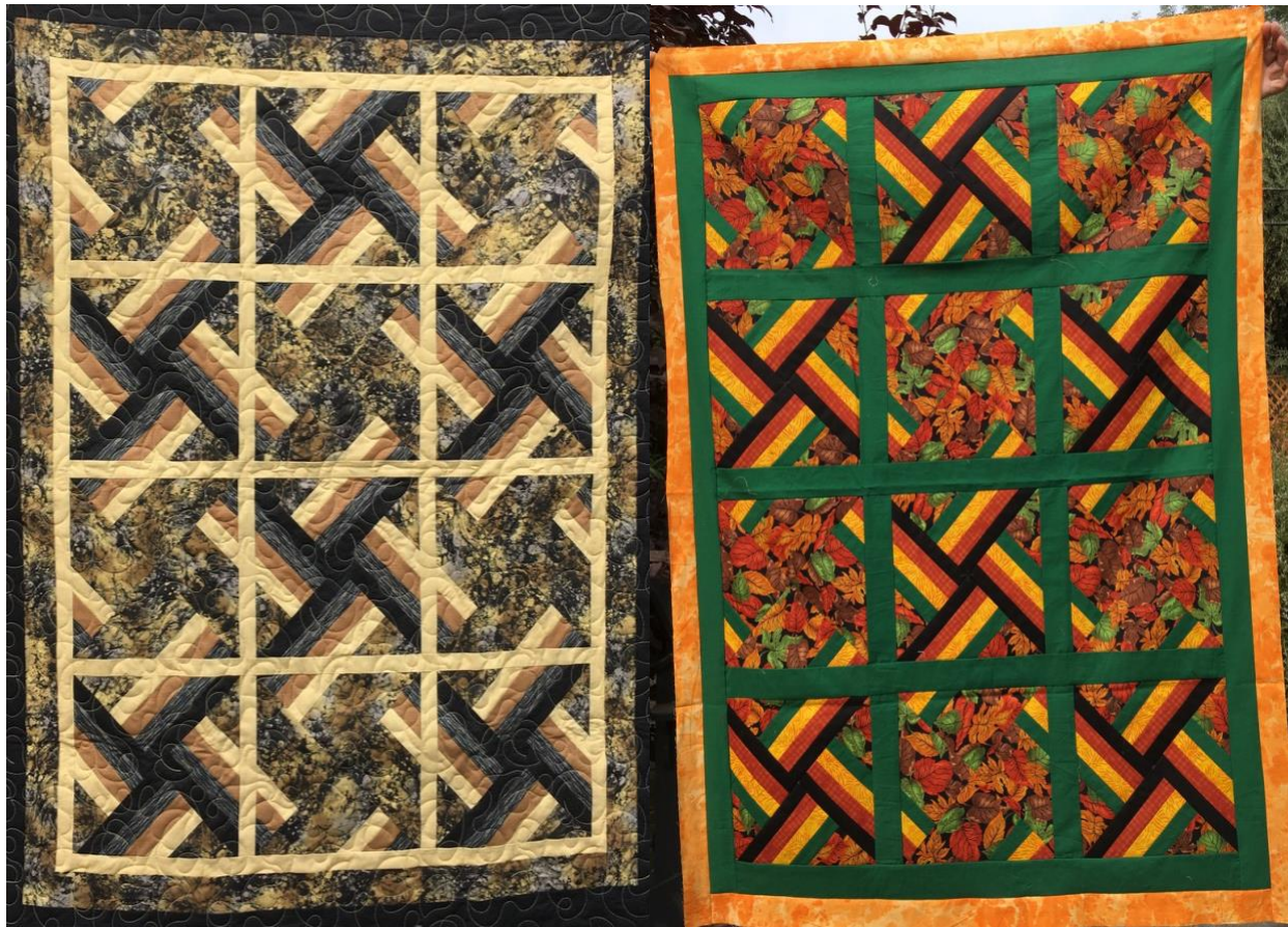
ABOVE TWO QUILT TOPS WERE MADE FROM THE SEPTEMBER BOM QUILT TOP BELOW MADE FROM AUGUST BOM