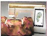
Sales, Service, Lessons