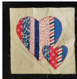
STRING PIECED HEARTS